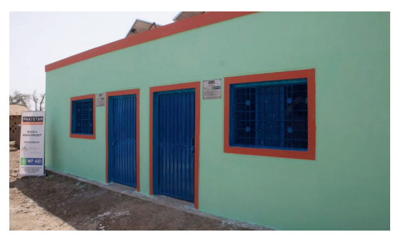
*Each home is equipped with solar panels (185 watts), 1 fan, and 2 light bulbs.